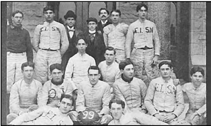
Initial Football Team in front of Old Main, 1899