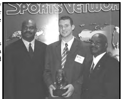
Top: Tony Romo in action during the 2002 season as he won the Walter Payton Award. Middle: Romo in action with the Dallas Cowboys during his 2006 Pro Bowl season. Bottom: Romo accepting 2002 Walter Payton Award at ceremony in Chattanooga, Tenn.